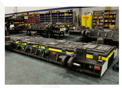
Design and build of one die or a 40-die-package. we can handle the project from start to finish.