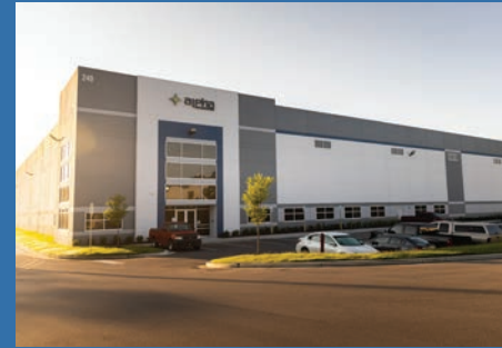
La Vergne, TN