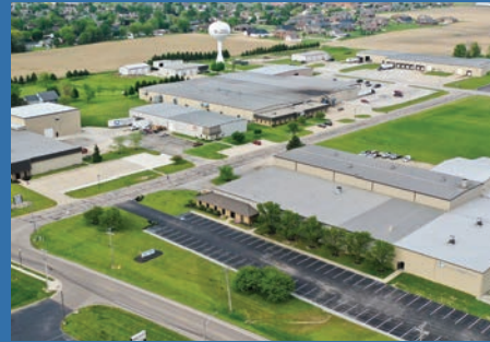
Fort Loramie, OH